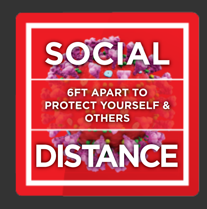
EXP_SD_05 12" x 12"