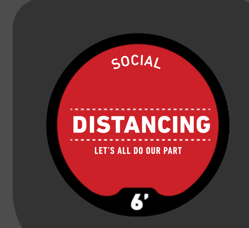
EXP_SD_01 12" x 12"