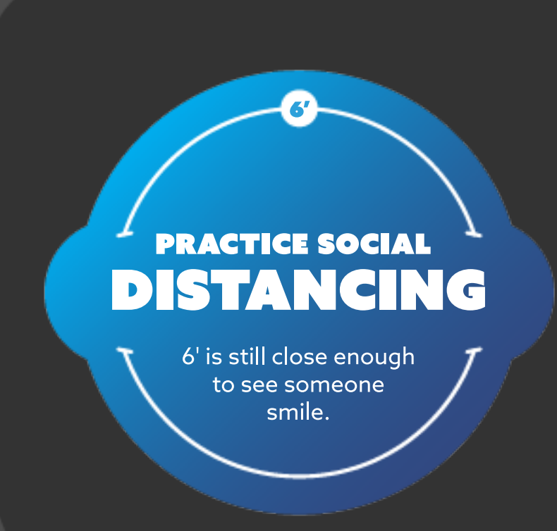
EXP_SD_02 12" x 10.5"